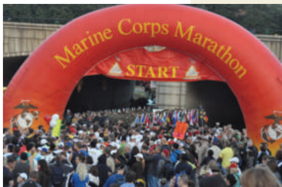
The starting line for the 2010 Marine Corps Marathon.